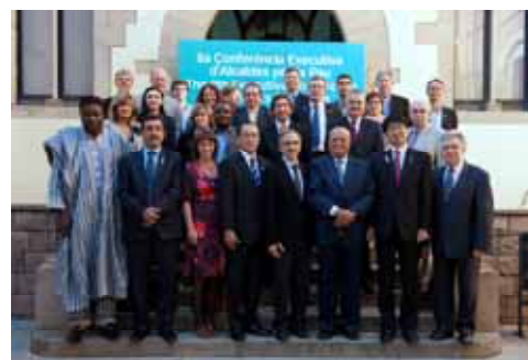
Participants of the 8th Executive Conference