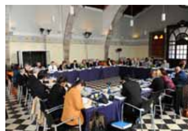
The 8th Executive Conference of Mayors for Peace